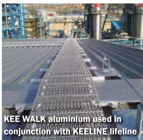
KEE WALK aluminium used in conjunction with KEELINE lifeline

Can be used in conjunction with other products to provide a complete fall protection plan.