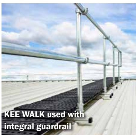
KEE WALK used with integral guardrail