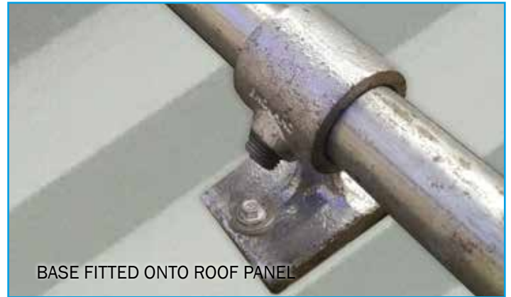
BASE FITTED ONTO ROOF PANEL