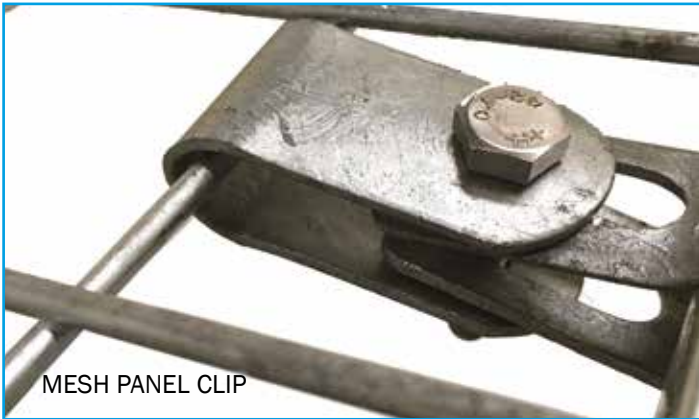
MESH PANEL CLIP