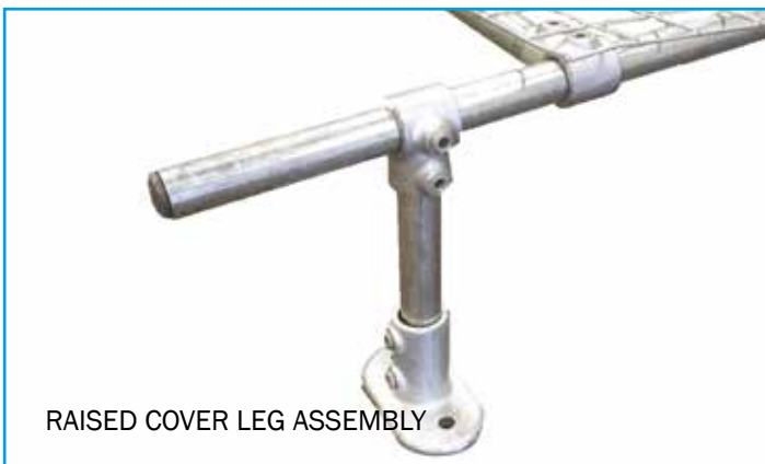
RAISED COVER LEG ASSEMBLY