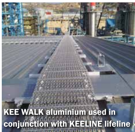
KEE WALK aluminium used in conjunction with KEELINE lifeline

Can be used in conjunction with other products to provide a complete fall protection plan.