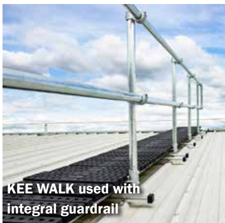
KEE WALK used with integral guardrail