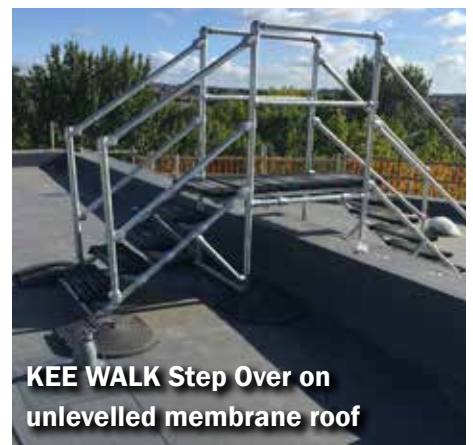
KEE WALK Step Over on unlevelled membrane roof